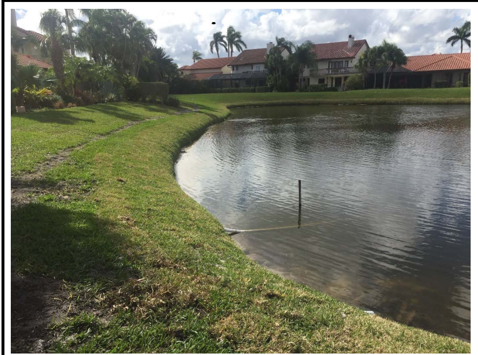
5 - (1/11/2018): Facing west from the south east corner of the lake.