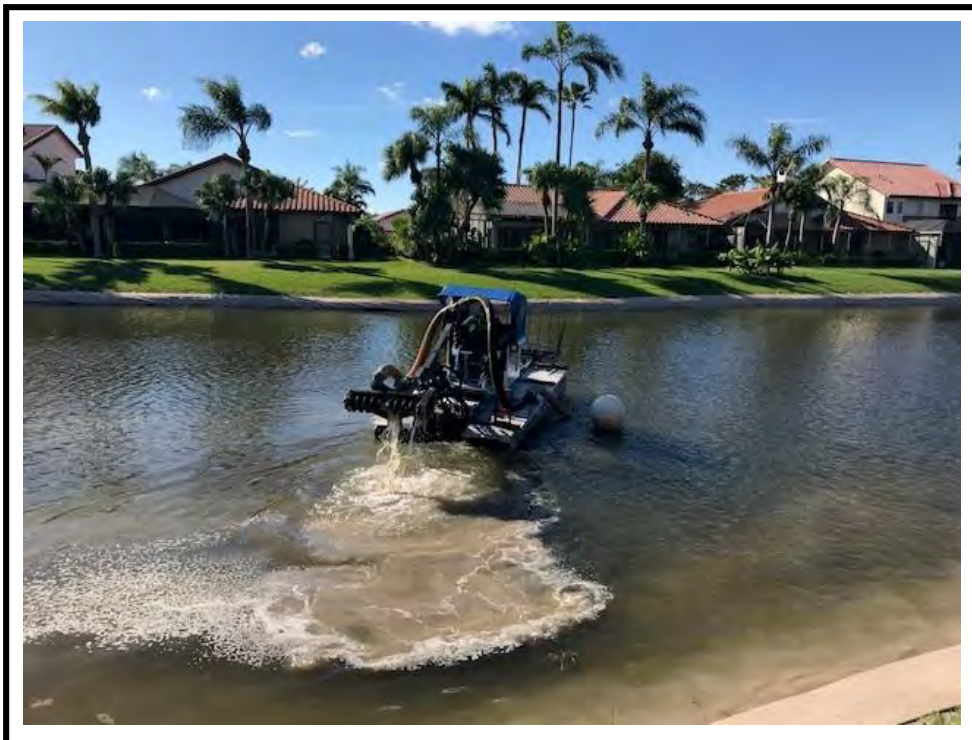
6 - (12/12/2017): Amphibious dredger moved northward along the eastern shoreline of Lake #3 to continue installation of in-situ soils materials within membrane.