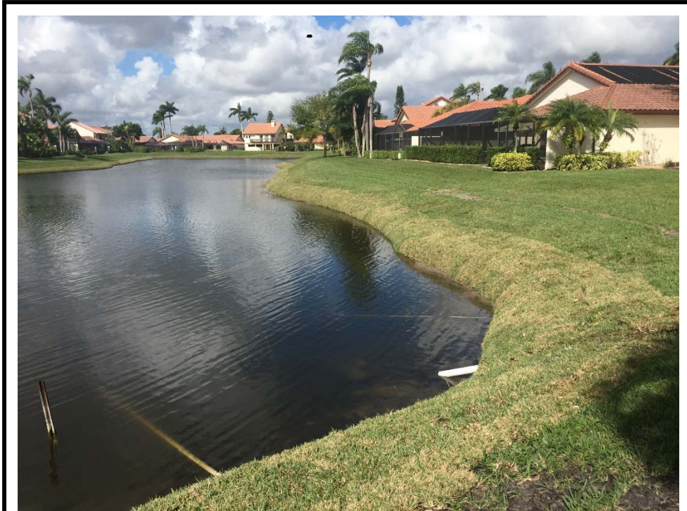
4 - (1/11/2018): Facing north from the south east corner of the lake.