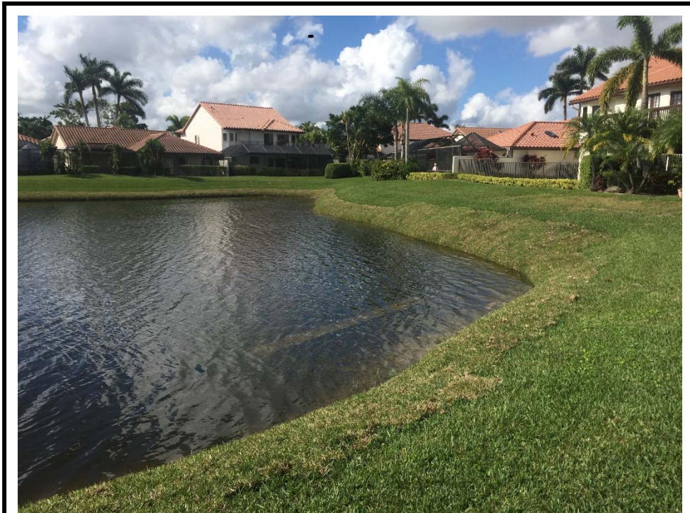
6 - (1/11/2018): Facing north west from the eastern bank, showing the northern bank of the lake.