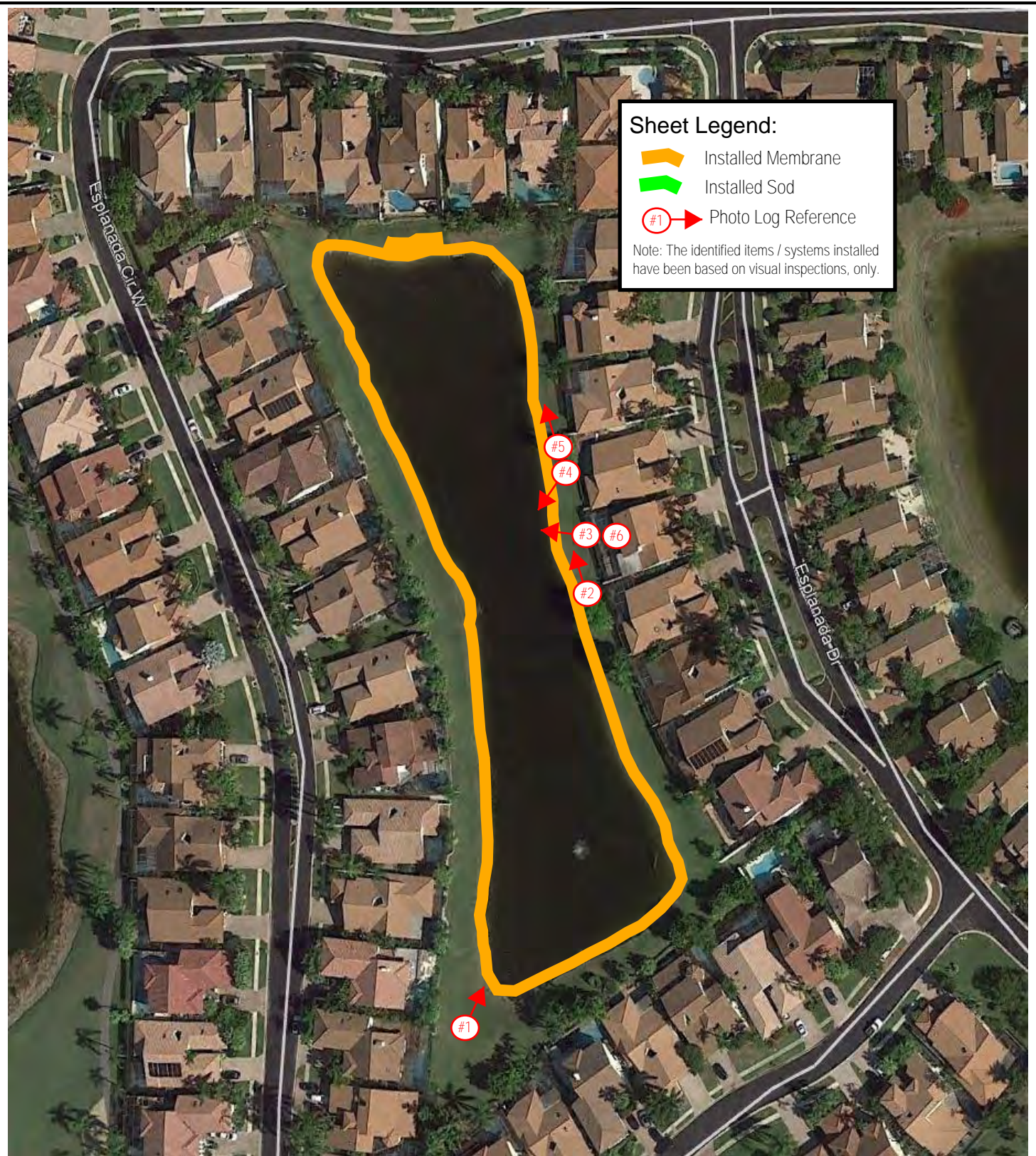
Aerial Image of Work (12/12/2017): Demonstration of Work Area conducted for the day's Inspection