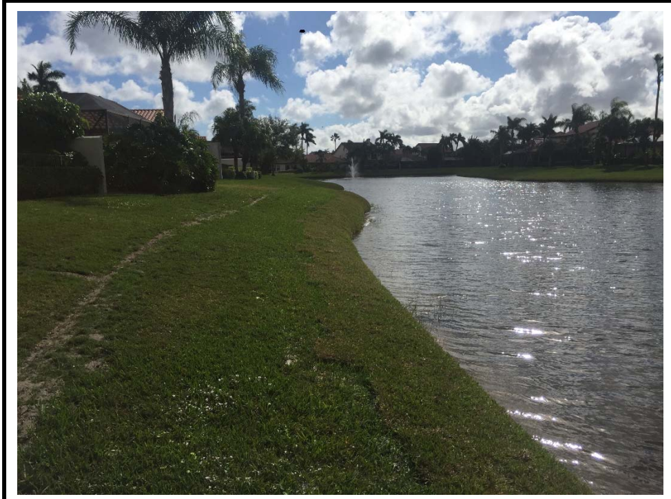
7 - (1/11/2018): Facing south from the north east corner of the lake.