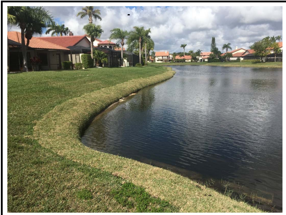
2 - (1/11/2018): Facing north from the south west corner of the lake.