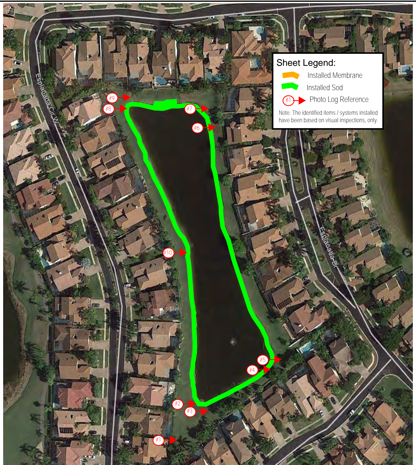
Aerial Image of Work (12/11/2017): Demonstration of Work Area conducted for the day's Inspection