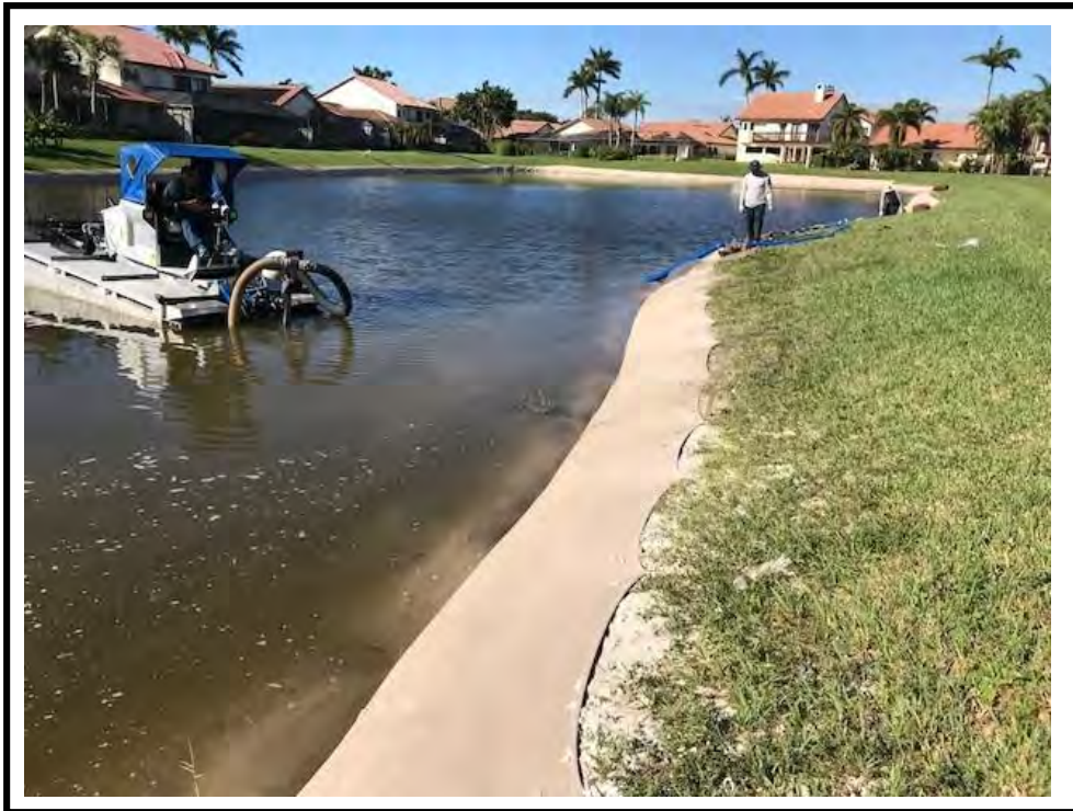
2 - (12/12/2017): East side of lake facing north. Photograph taken at today's "starting point" of membrane fill. NOTE: Work did not start until +/- 1:15pm due to equipment issues.