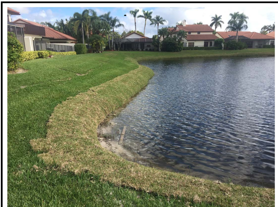
8 - (1/11/2018): Facing east along the north bank from the north west corner of the lake.