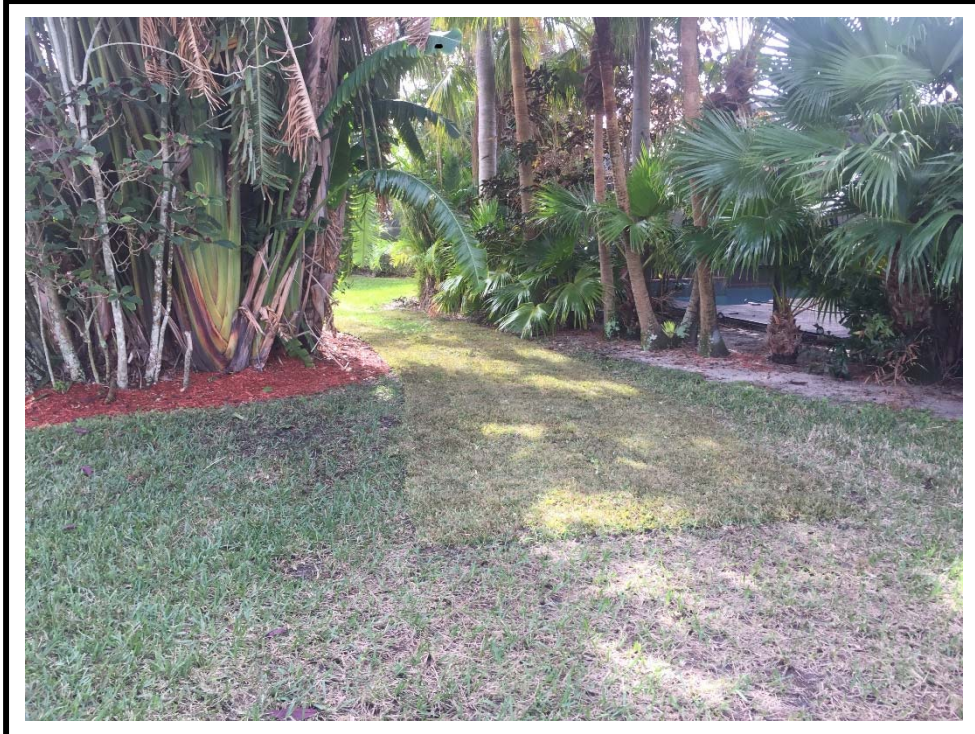
1 - (1/11/2018): Facing south, away from the lake, showing the re-sodded entrance completed.