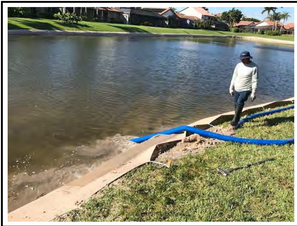
3 - (12/12/2017): East side of Lake #3 where work was conducted in filling dredged soils into membrane (i.e., Dredgesox™); photo taken facing northward.