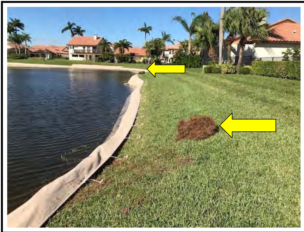
5 - (12/12/2017): Lake & Wetland Management, Inc. utilized small bale(s) of pine needles (yellow arrows) used as part of membrane fill in proximity of PVC lines to minimize washout during dredging soils installation.