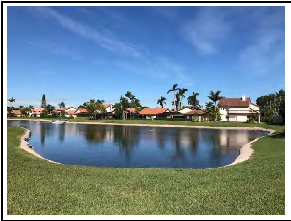
1 - (12/12/2017): Overview of Lake #3 from the southwest corner. Amphibious dredger in the background working on east shoreline.