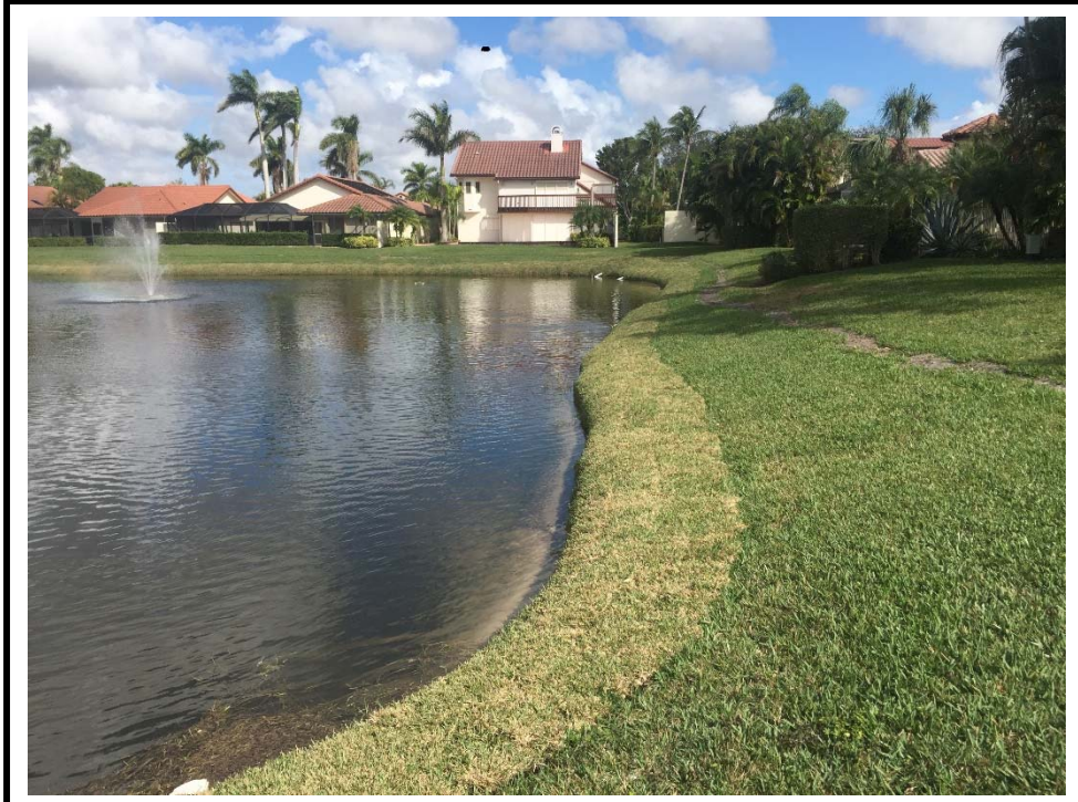
3 - (1/11/2018): Facing east from the south west corner of the lake.