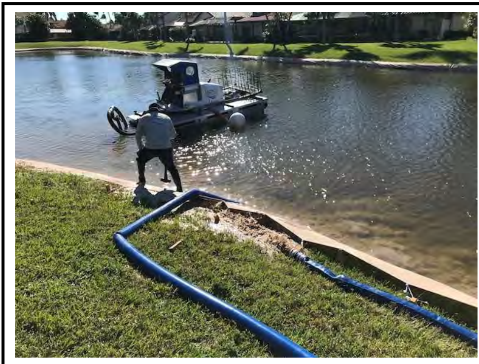
4 - (12/12/2017): East side of Lake #3 where work was conducted in filling dredged soils into membrane (i.e., Dredgesox™); photograph taken facing southward.