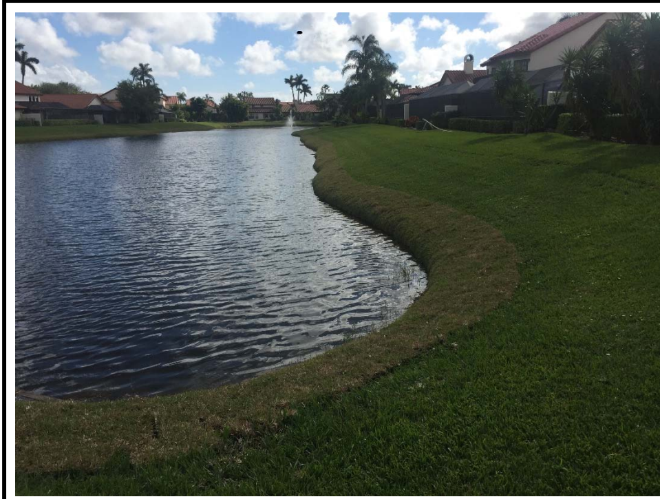
9 - (1/11/2018): Facing south from the north west corner of the lake.