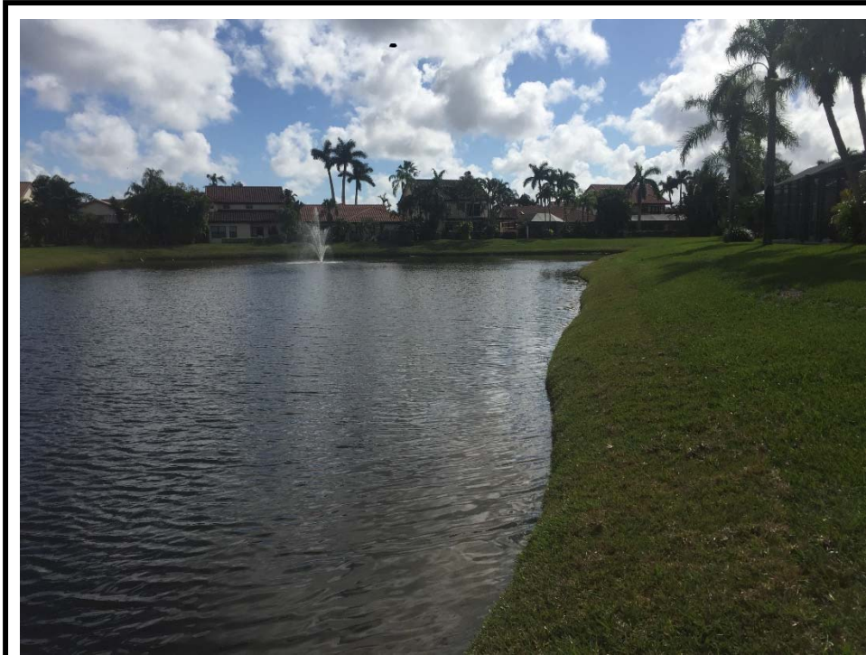
10 - (1/11/2018): Facing south along the eastern bank of the lake.